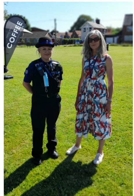
Working with our parish councils to keep communities safe.