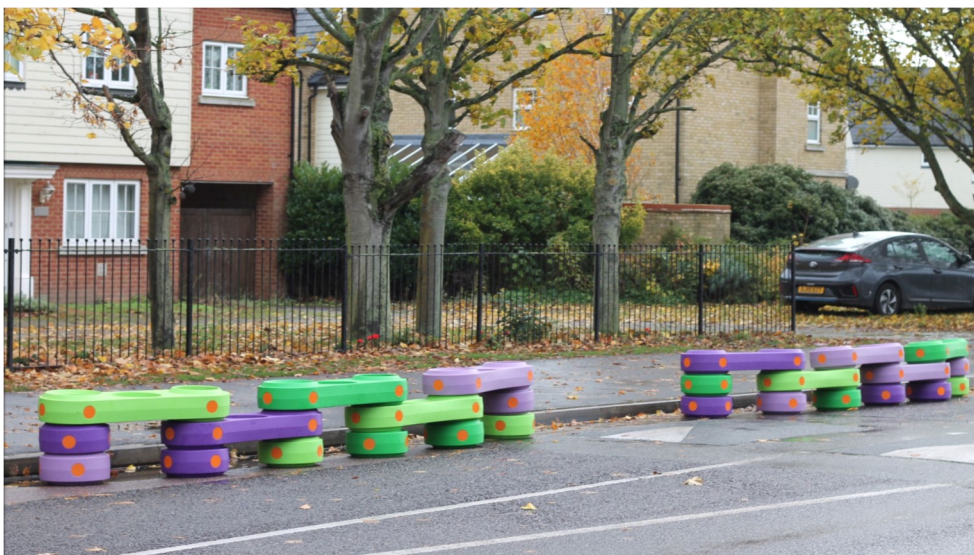
Our street kit on Winstree Road at Stanway Fiveways Primary School