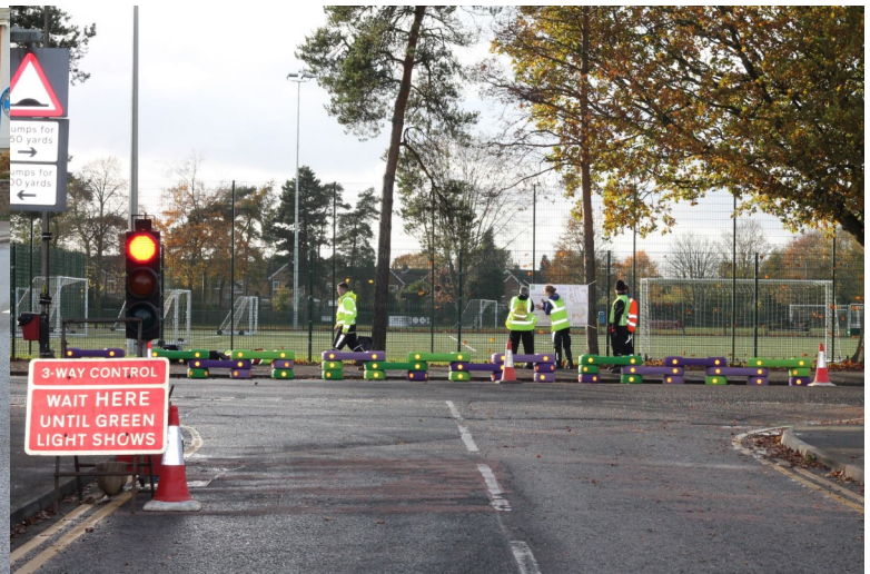
Street kits trials at the Wheatfield Road junction

This next phase was due to take place in June 2020 however as a result of the current situation it has been agreed to move these to October 2020. This gives us lots of extra time to work together to find the best solution for Winstree Road.