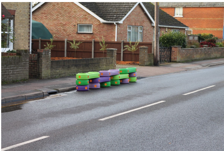
Street kits trials on Chapel Road junction